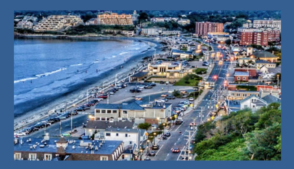
The Nantasket Beach Business Improvement District

customers, and businesses to the area is another project expected to dominate commercial discussion in 2024.