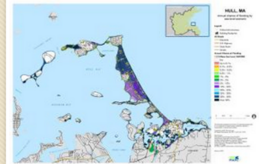
Mass Coastal Flood Risk Model applied to Hull