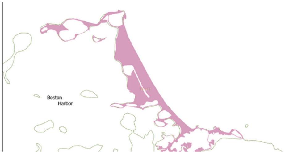
Hull's Floodplain 2024

Floodplains Management, Stormwater Management, Wetlands Protection Act Administration