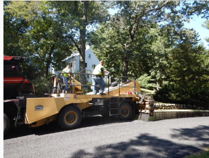
Rubber Chip Seal