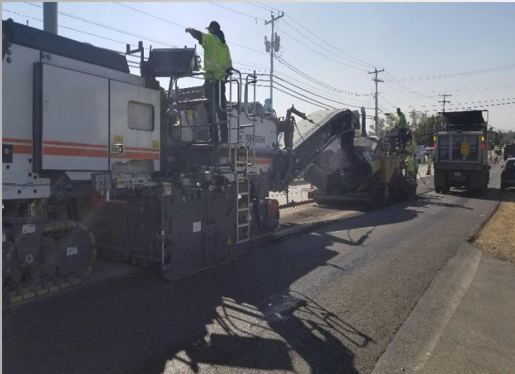
Cold In-Place Recycling