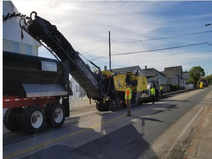
Mill and Overlay