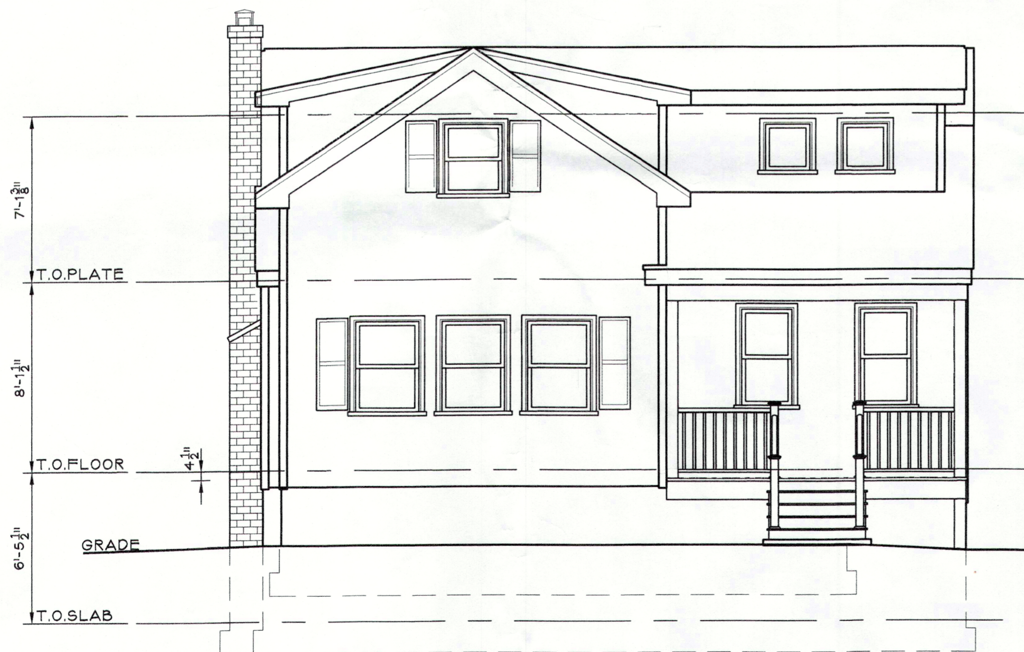
C FRONT ELEVATION A-1 SCALE: 1/4"=1'-0"