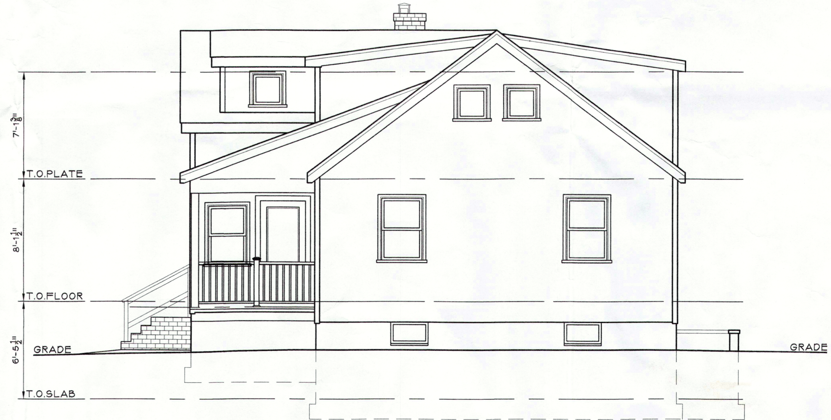
D RIGHT ELEVATION A-1 SCALE: 1/4"=1'-0"