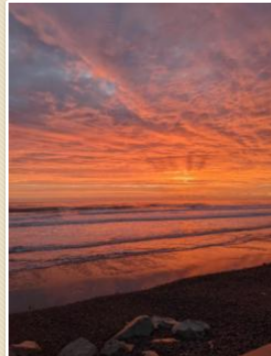
Sunrise over Nantasket Beach