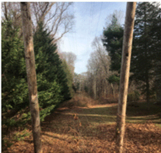
Cross Street towards Hull (cross country)