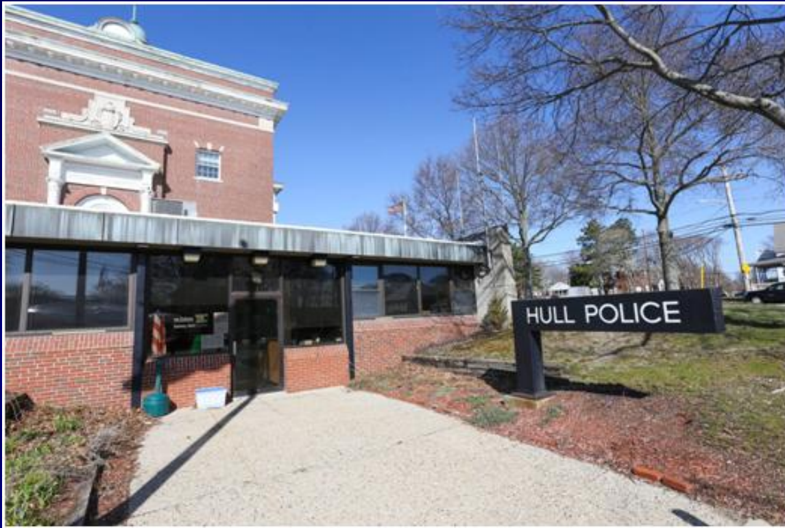
Hull Police Headquarters