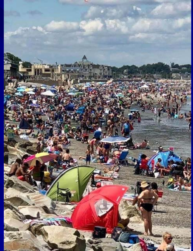
Nantasket Beach July 2020