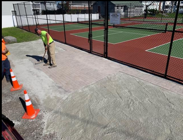
Sidewalk repairs and Finishing touches @ New Pickle Ball courts.