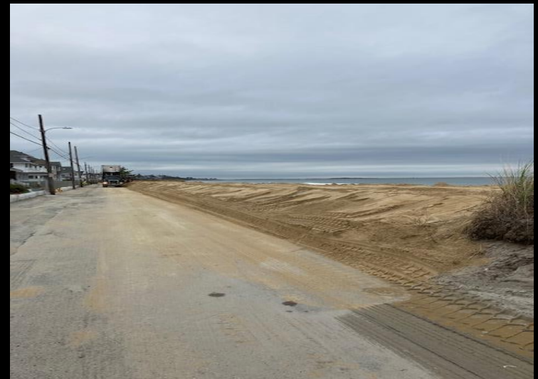
Dune Build @ Beach ave and A st., New MOBI mats and Beach fence repair and Maintenance