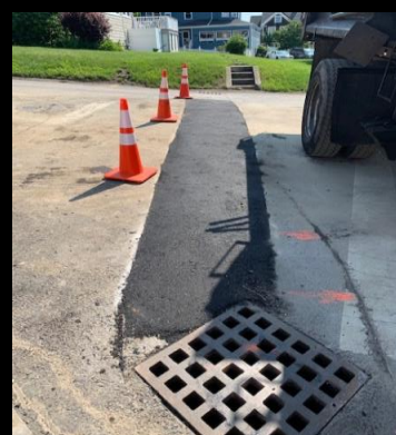
Drainage Repairs and Erosion control.