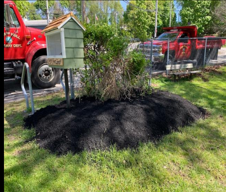
Parks Maintenance Hull War Memorial and Lst Ball Fields and Little Library @ Village Playground