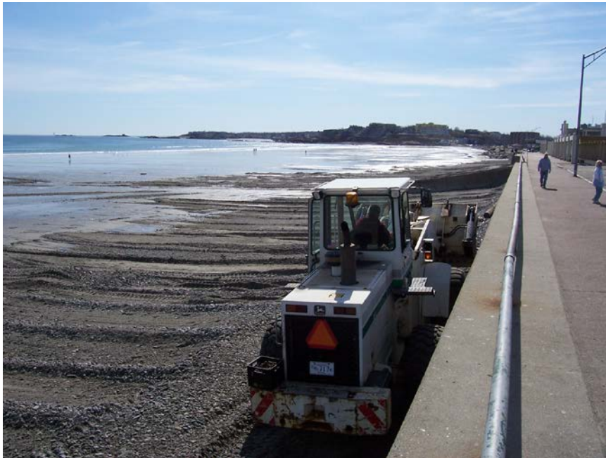
Photo 6 Seasonal work performed at Nantasket Beach.

protecting the sea wall is to prevent instability by keeping material against the wall face to a critical height where the wall will not topple and the wall footing is not exposed.