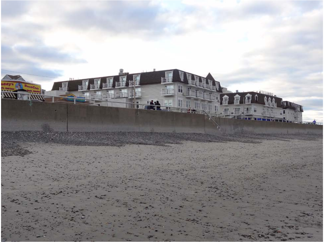
Photo 4 The Nantasket Beach Resort Hotel complex is situated at the north end of Zone 2, directly across Hull Shore Drive from the sea wall.