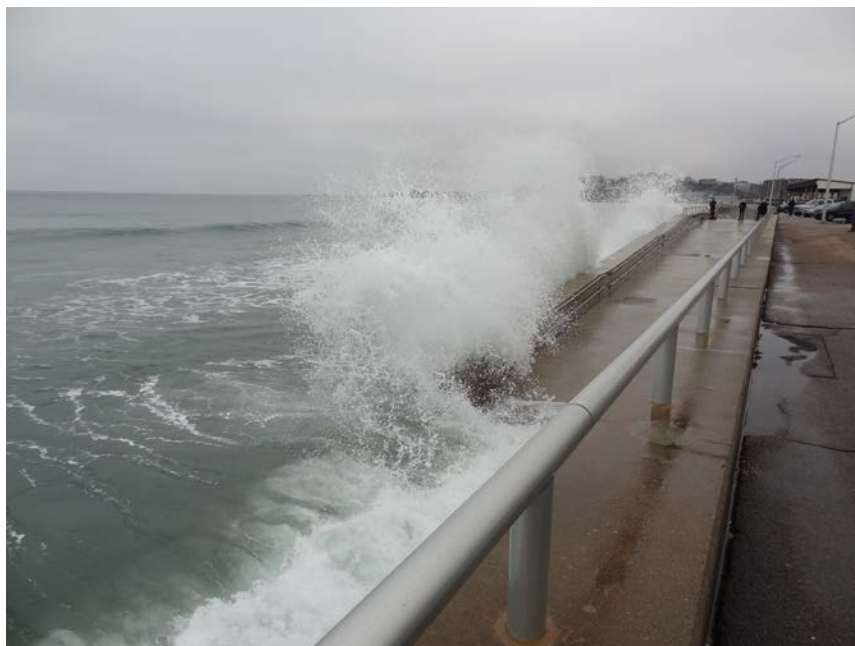
Photo 7 Waves overtop the sea wall in front of the DCR bath house.