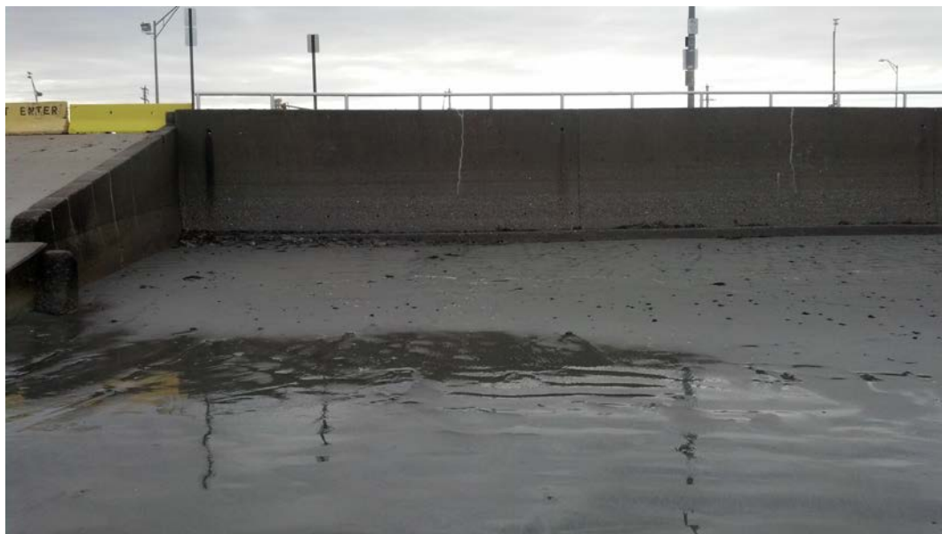
Photo 3 This view of the sea wall taken after a storm shows the portion of the wall footing is exposed.