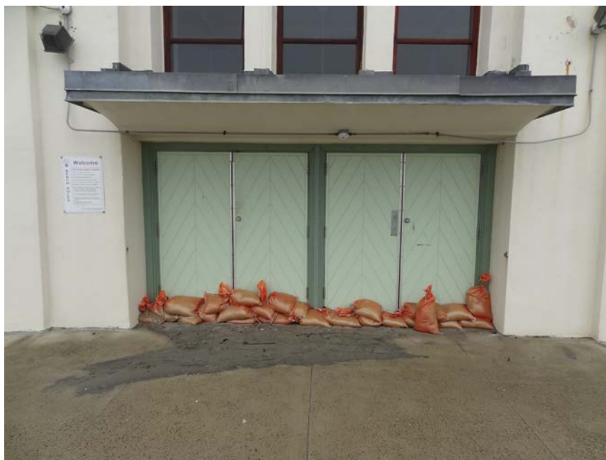
Photo 8 These sand bags are a necessary off season measure to prevent water coming over the sea wall from entering the DCR bath house.