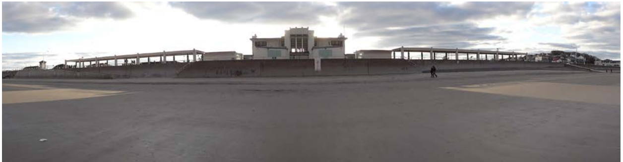
Photo 1 A view of the south end of the sea wall in Zone 2 with the DCR bath house and other public infrastructure behind it.