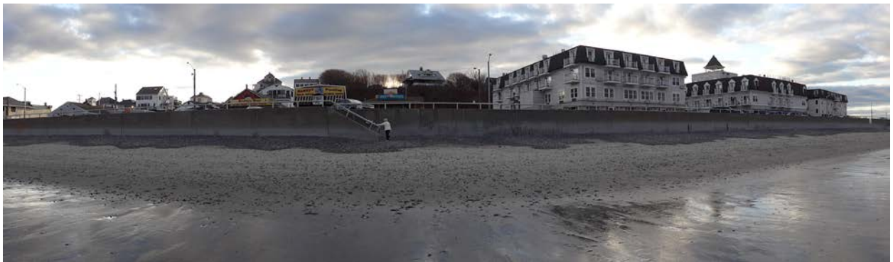
Photo 2 A view of the sea wall at the north end of Zone 2 with commercial properties lining Hull Shore Drive beyond.