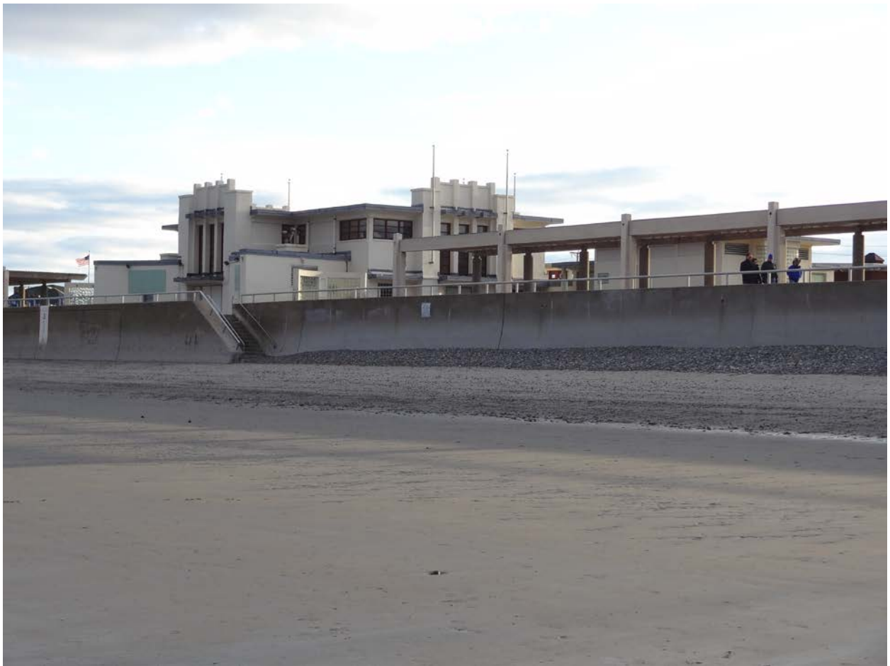
Photo 5 The DCR bath house is located very close to the sea wall in Zone 2.